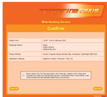
User receives instant confirmation

Cordic's Web Booker system is highly configurable, easy to deploy and works automatically and concurrently with your cPAQ in-office booking system with no disruption to ongoing activity.