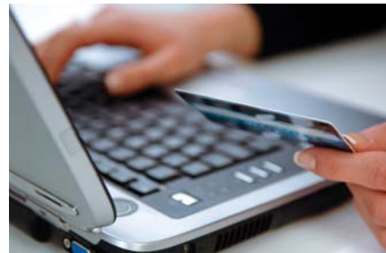
Accepts secure card payments

Cordic's highly configurable and customisable Web Booker offers the most complete online booking system on the market.